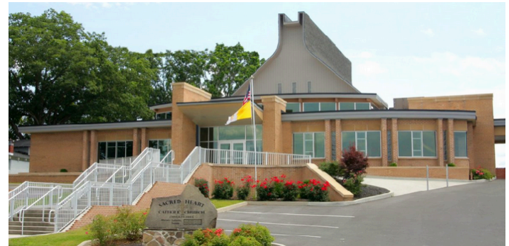
Sunday Mass is livestreamed

@shprinceton • Instagram photos and videos